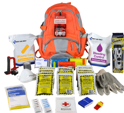
Shelter in Place Preparedness Part No. B3127052

Uniquely designed for up to twenty persons during a potentially dangerous situation outside with essentials to keep your group safe.